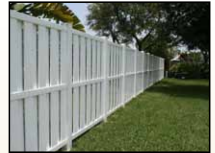
Vinyl Semi Private Fence