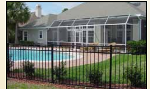
Aluminum Rail Fence