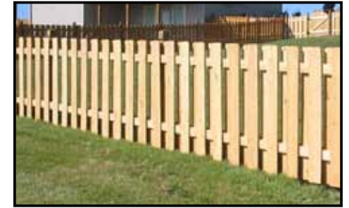
Wood Shadowbox Fence