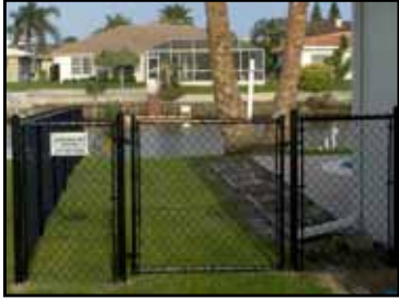
Vinyl Coated Chain Link Fence

(Check with your HOA, they may have stricter regulations)