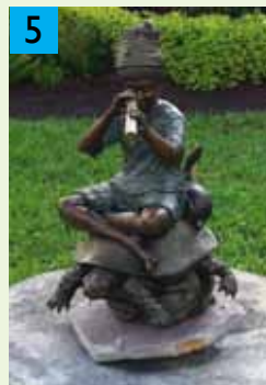
Natural Wonders Michele Dale Bronze