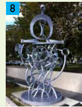
Shanti (Peace) Claudia Jane Klein Aluminum plate and tubing, epoxy powder coated, Marine Urethane top coat