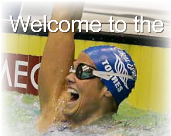
Coral Springs Swim Club Swimmer // Dara Torres Five-time Olympian (2008, 2000, 1992, 1988 & 1984); 12-time Olympic Medalist; First American to swim in 5 Olympic Games.

The Coral Springs Swim Club is a year-round competitive swimming program for children, teenagers and young adults. CSSC is a member of the United States Swimming, the Olympic development program for competitive swimming. The Coral Springs Swim Club has consistently ranked in the top four swim clubs in the nation for teaching stroke excellence. In addition, CSSC won nine Florida Gold Coast Junior Olympics Championship titles in the past ten years, and in 2008, eight of the CSSC swimmers participated in the Beijing Olympic Games, including three-time silver medalist Dara Torres.