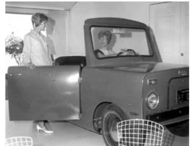
Westinghouse bought Coral Ridge Properties so it could use Coral Springs as its urban laboratory to test its newest innovations, including the Marketeer, an electric car.