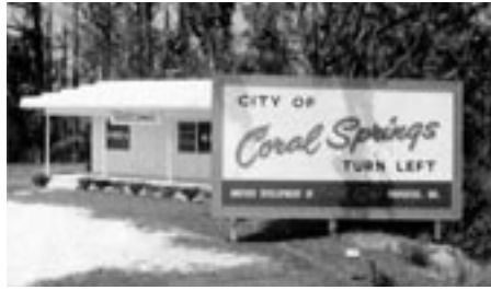
The original building sat at the corner of Wiles Road and 441 in 1964, and was used as a real estate office.

Originally built by Coral Ridge Properties in 1964 as a 30' x 20' real estate sales office, the building that is now home to the Museum of Coral Springs History first sat at the northwest intersection of Wiles Road and State Road 7 (441). The location was not even in Coral Springs at the time, but Wiles Road was the only access into the City, which did not have a paved road and had only a Covered Bridge as architecture. Coral Ridge employees would market property using the City's Master Plan, neighborhood plats and house models from builders' brochures. By 1966, Coral Ridge had constructed a large administration building, which is now City Hall, and asked if the City of Coral Springs wanted the "old building."