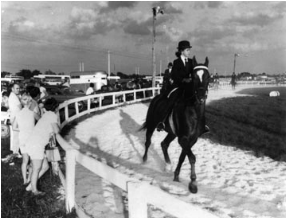
The Coral Springs Horse Show Grounds ran along the south side of Wiles Road, west of Coral Hills Drive.