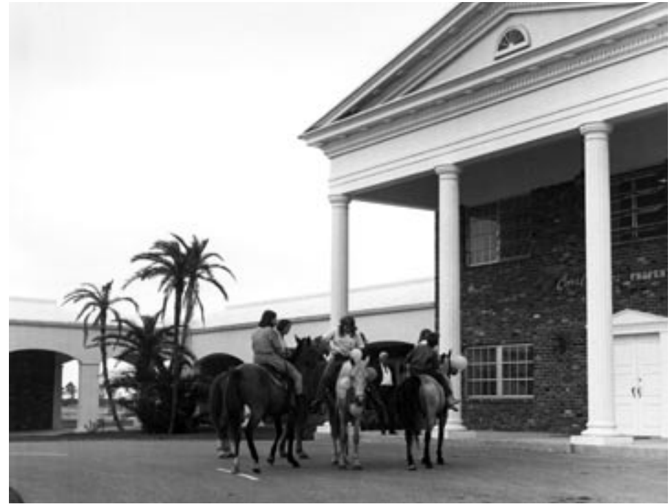
There was no local delivery until 1970, so residents came to the Coral Ridge Properties Administration Building to retrieve their mail.