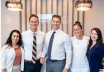
Commissioner Award: Friends & Family Spinal Care