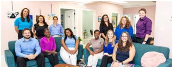
Company to Watch: Genesis Counseling