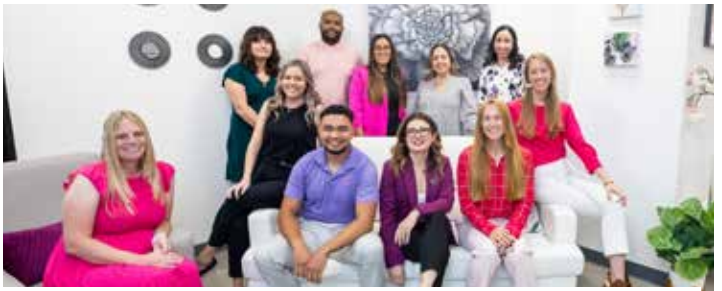
Small Business: Bright Pink Agency

Congratulations to the winners of our 2023 Business Excellence Awards! These shining stars contribute to the economic vitality of our city by creating job opportunities, generating revenue, and embracing a spirit of community pride.