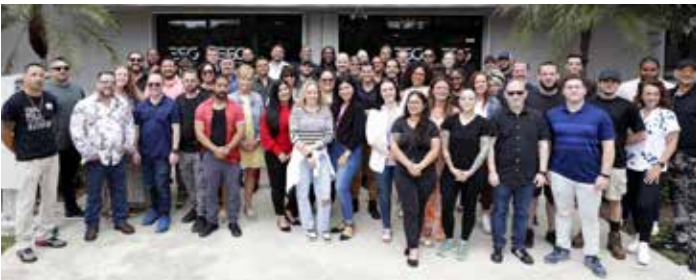
Large Business: ESG (Event Services Group)