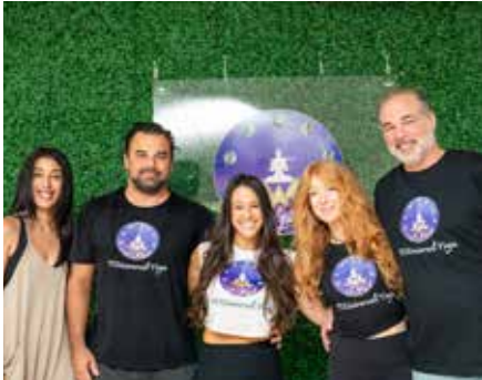
Sustainability: YOUiversal Yoga