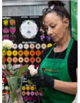
Legacy Award: Darby's Florist