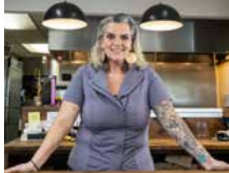
Heart of the Community: Hellenic Republic